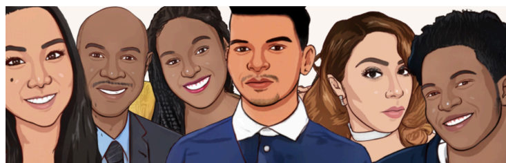
Standing with People of Color September 22nd

Nurture Nudge See if you can put yourself in a multicultural situation this week or remember a time when you were welcomed by someone from a different culture. What was your comfort level? What would you like to do differently?